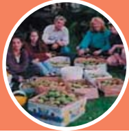
The Fruit Tree Project brings together a range of community members to harvest and share fruit.

Recreation: Edible plants engage people as they grow, harvest, and eat them. Whether in a private garden or a public space, people become more involved and connected to the land and the food that they grow.