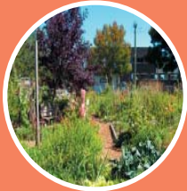
Mt. Pleasant Community Garden: A garden plot can produce vegetables all season long in Vancouver.

Health: Edible plants are nutritious and delicious. By participating in growing and harvesting your own food you can also ensure that no chemicals are used on them.