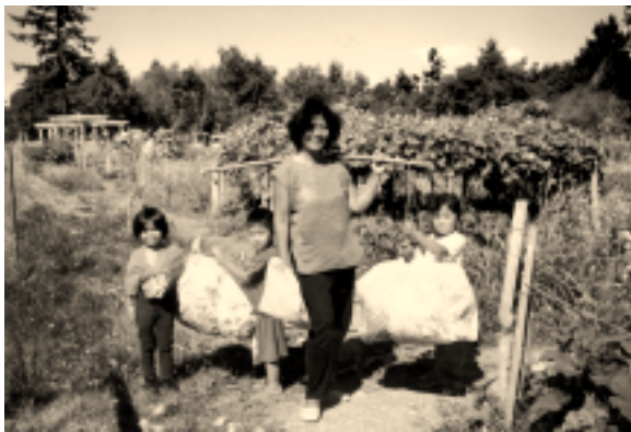
Cambodian gardening family at the Salishan Family Garden

One of the keys to building successful community food system projects is developing connections between diverse stakeholder groups. The nature of the relationships will vary, depending on the project's focus. All coalition members do not have to be equally involved in each project, but it is necessary that they are all kept informed. It takes a long time to build trust among diverse stakeholders. A year is a reasonable period to expect just get to know each other.