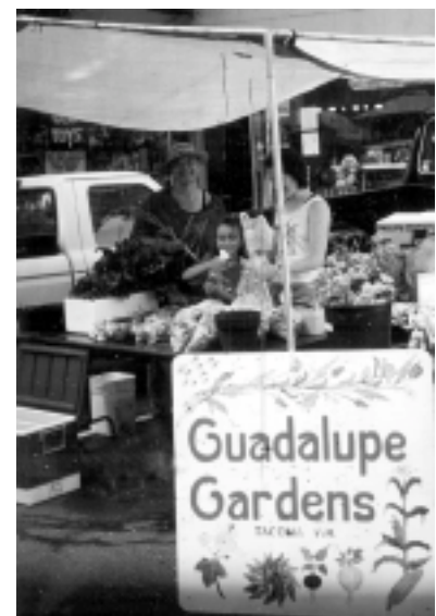
Guadalupe Gardens farmer and family at Tacoma Farmers Market.