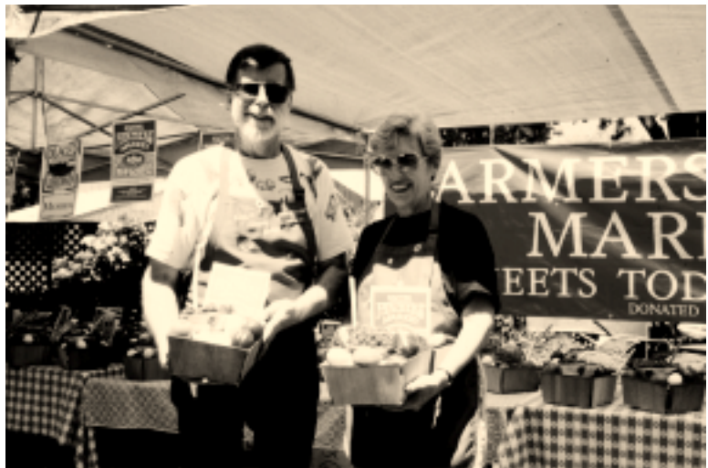
Foothills Farmers Market Association.

Finally, we recommend finding time to celebrate your successes. The energy created from having fun together helps strengthen and motivate the participants of a community's food system. Celebration is a vital part of the rhythms that often is forgotten amid the intense work of community organizing, planning, fundraising, and project activities. Celebration also offers an opportunity to engage other community stakeholders in the project's efforts.