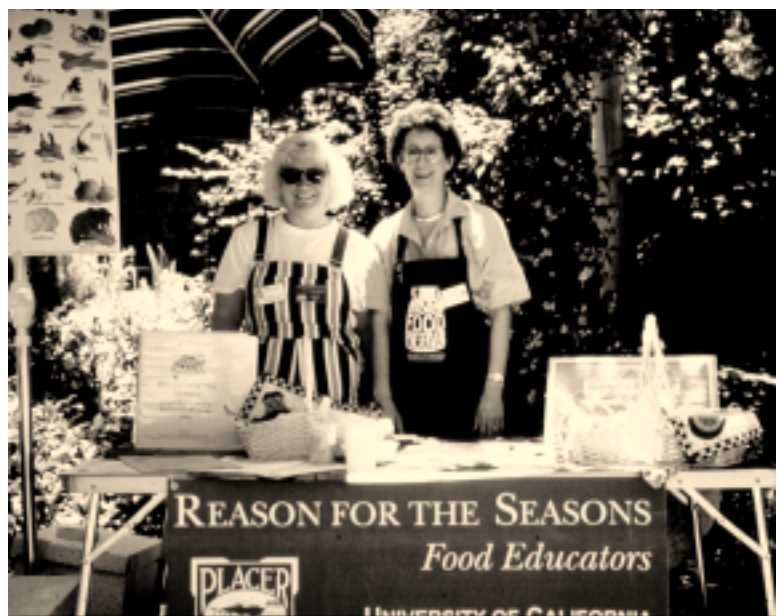
Reasons for the Seasons food educators.

Grower education. PlacerGROWN sponsors an annual farm conference in Placer County for all growers. Multiple workshops provide information about sustainable production practices for growers and ranchers, new marketing opportunities, season extension practices, and value-added food processing as well as local agricultural policy initiatives.