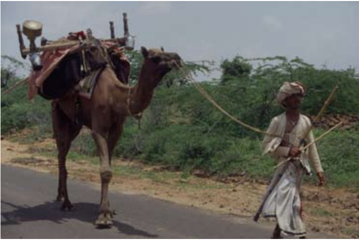
A Rebari camel-owner from Gujarat