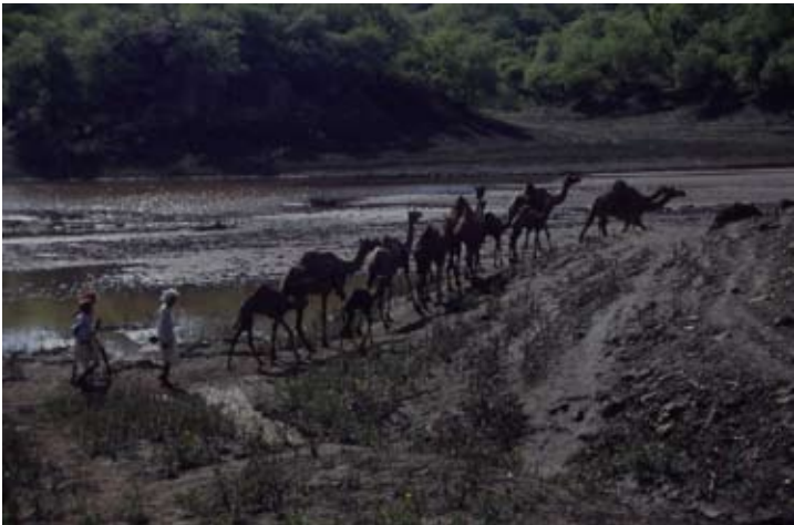
The Kumbalgarh Sanctuary in Rajasthan is a traditional grazing ground for Raika pastoralists