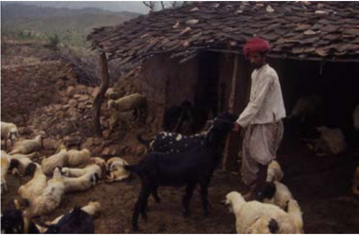
A Raika herder and his mixed herd