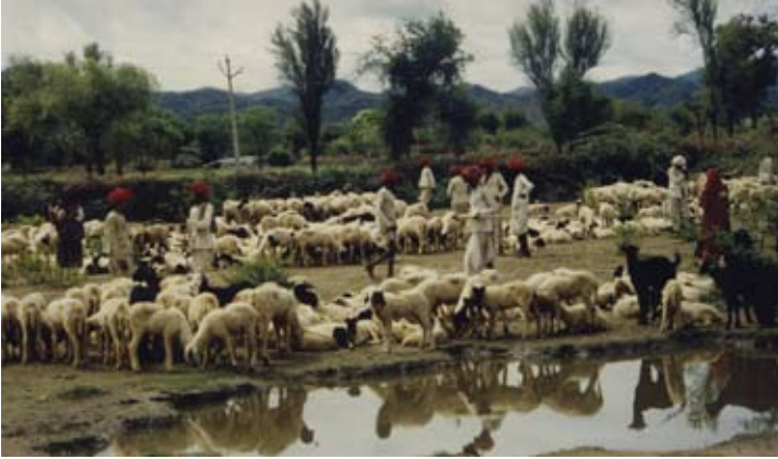
A Raika sheep flock migrating back home during the rainy season