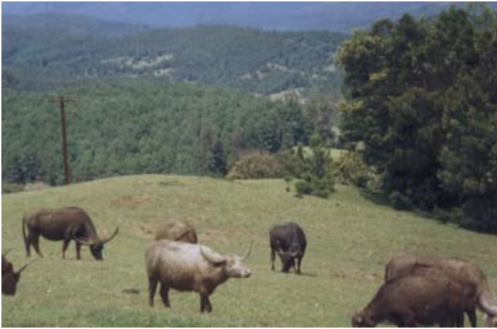
Open pasture land in the Nilgiri Hills where the Forest Department is trying to plant trees