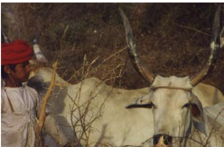
Nari cattle (undocumented breed)