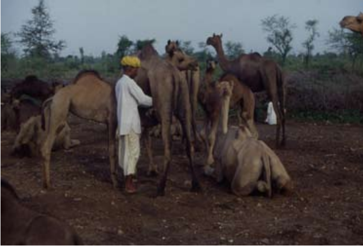
A Raika camel breeder milking his animals