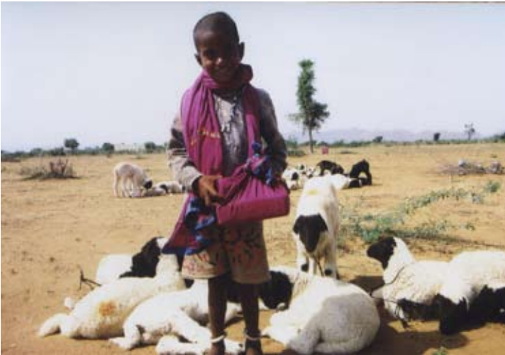
Raika children learn to take care of animals at an early age