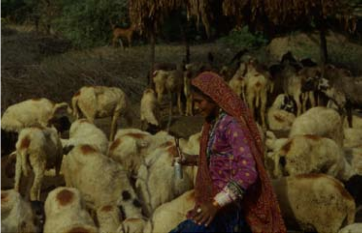
A Raika woman among her sheep