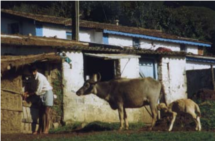
Toda buffalo breeder