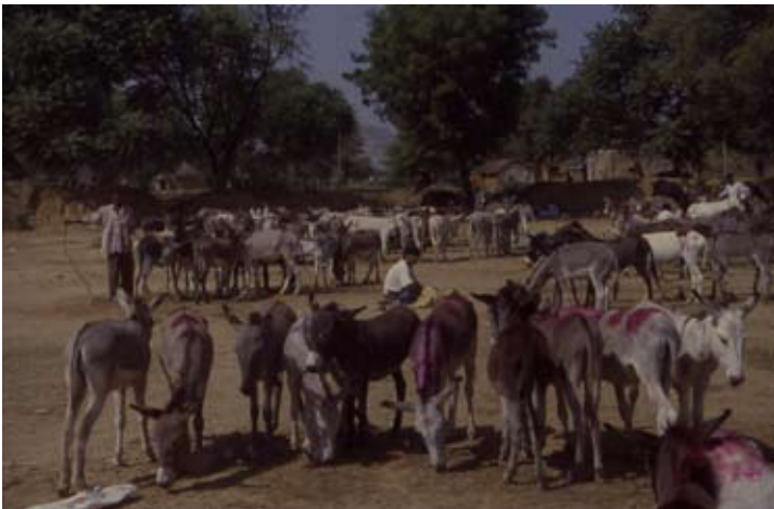
Donkeys – a neglected species