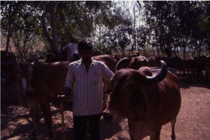
Gir cattle with their keeper