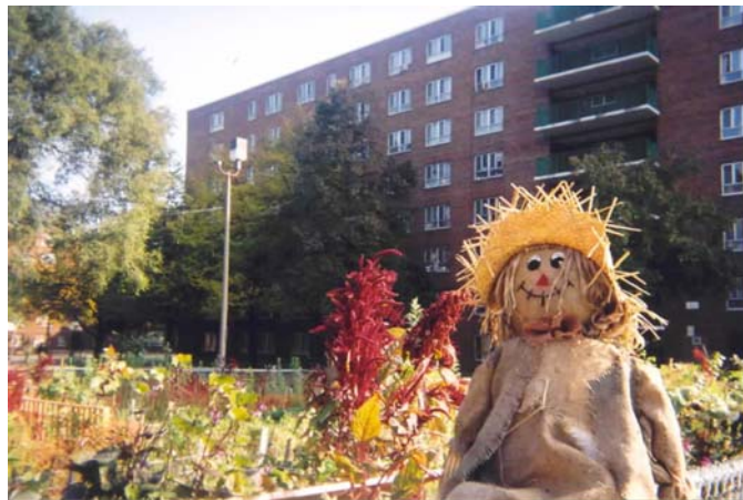
Christian Resource Centre

This report is one part of a broader attempt to return the results of this research to the community, and to highlight to a wider audience the importance of community gardens as a mechanism for promoting urban health (see Table 4 for a list of other research distribution activities). It is our hope that this research will serve as a catalyst for the maintenance of existing community gardens and the creation of new ones, to the greater benefit of the citizens of Toronto.