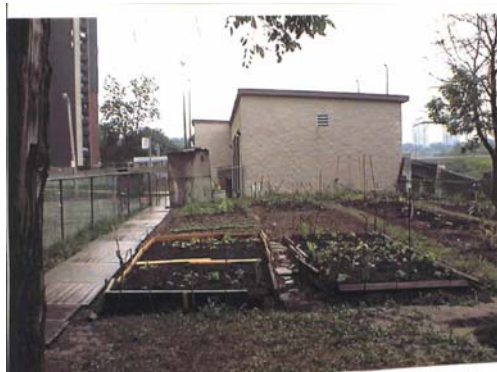
220 Oak St. Community Garden

In this way, community gardeners see an intimate connection between the quality of local (urban) environments and risks to their health, in ways that non-growers may fail to recognize. Interestingly, preliminary testing conducted in a related project suggest that city-grown vegetables from one downtown garden were no more contaminated than their supermarket counterparts (Diamond, 2005) – however, urban soils can be contaminated from past land uses, and so should be tested prior to garden development in order to ensure that no contaminants are present at the garden site. In most of the gardens studied, soil tests had been conducted early in the development of the gardens, and steps were taken to mitigate the site if necessary.