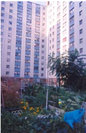
Growing Together

Existing educational programs within the community gardens were highly valued and encouraged. Gardeners had ideas for additional programming which were voiced by a number of participants and interest was expressed in programs that would allow and encourage community members to stay involved in community gardening over the long winter months. Participants also spoke about the importance of involving the elderly, youth, and youth at risk in community gardening: