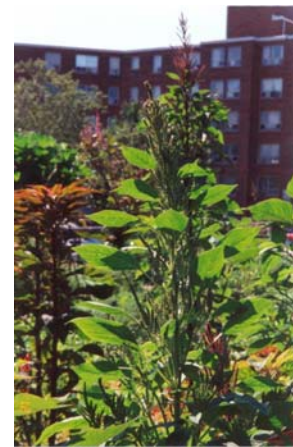
Christian Resource Centre

...maybe something that we really need to work at is maybe to give the kids some focus and starting some sort of a community garden, somewhere in the community, meant for kids who are troubled and who have nothing to do after school.