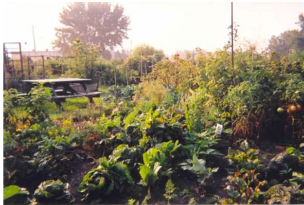
Leslie St. Allotment Gardens

It should be noted that in all cases, the sample size was small – approximately 55 people participated in focus groups, and 13 in interviews. These numbers are not large enough to allow us to make generalizations about how ALL gardeners, even within the study area, would respond when asked the same questions. Similarly, there were lots of interactions at the gardens that we did NOT see. The purpose of this research is not to be able to say what all Southeast Toronto gardeners do or think – instead, the research is intended as a window into the experiences of the particular gardeners that we spoke with and observed. At the same time, it is hoped that many of the themes and issues we identify will resonate with other gardeners – and in fact, our research dissemination and member-checking activities suggest that this is the case, and serve as a catalyst for further discussion and research.